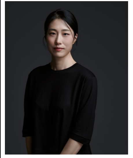
Suggested $10 donation goes to the St. John's Music Series

A recital of Scriabin, Liszt, and Schumann