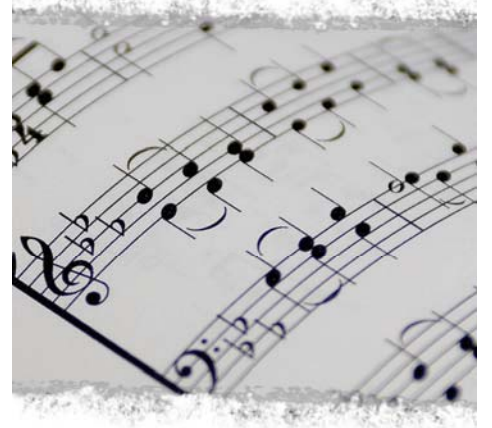
Psalm 13:6, NR&V

I will sing to the LORD, because he has dealt bountifully with me.