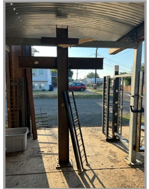
Above: the Gateway in progress this July. Below: the finished Gateway in place on the Welcome Center patio.