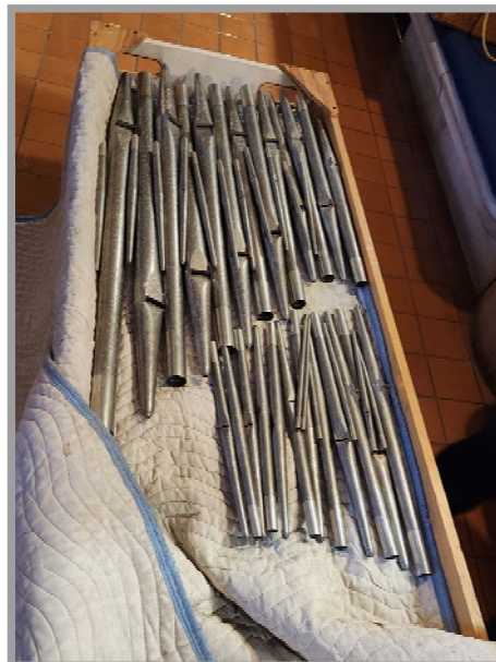
Above: several pipes prepared for transit.