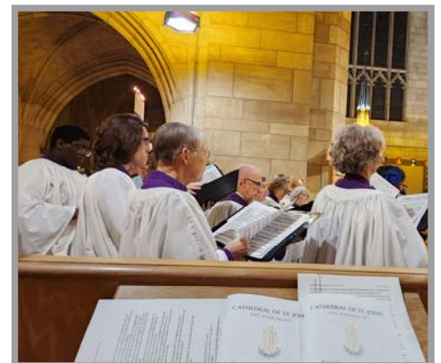
Above: the Cathedral Choir sings at this year's service of Lessons and Carols.